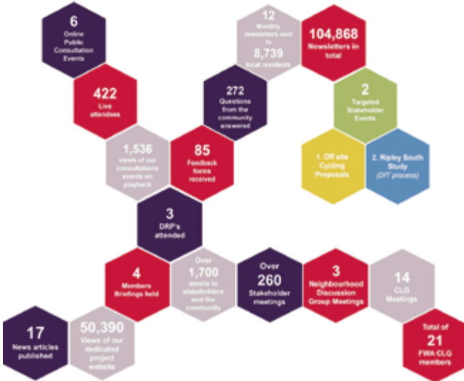
Key engagement statistics as of December 2021

In addition to these more formal consultation events, we have continued to engage with residents and stakeholders through meetings, phone calls and email. We look forward to continuing with these discussions as we approach submission of the Hybrid Application in Spring 2022.