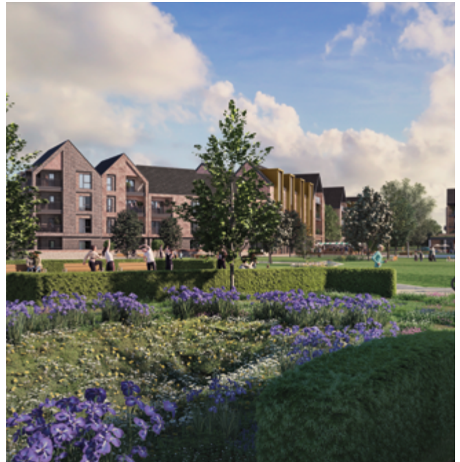
Illustrative image of the latest masterplan, as presented at our May 2021 consultation events

The application will include detailed plans for the Suitable Alternative Natural Greenspace (SANG) and access points, while the remainder of the application (including the housing) will be submitted in outline format.