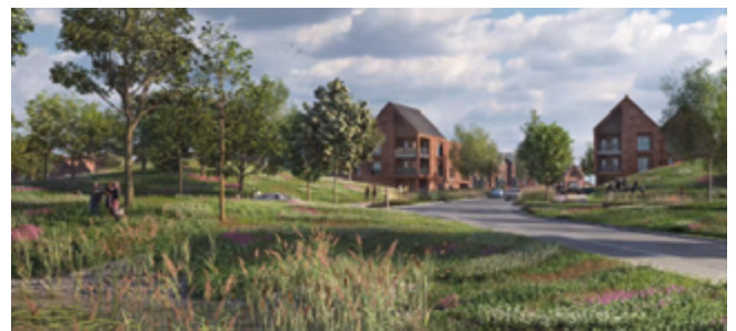
Screenshot from the fly-through video, as presented at our May 2021 consultation events

As presented at our consultation events, we have produced an illustrative fly-through showreel video of what the completed settlement could look like, bringing to life the plans and ideas outlined in the latest proposals. To view the video, please visit our website at www.wisleyairfield.com and scroll down to the showreel.