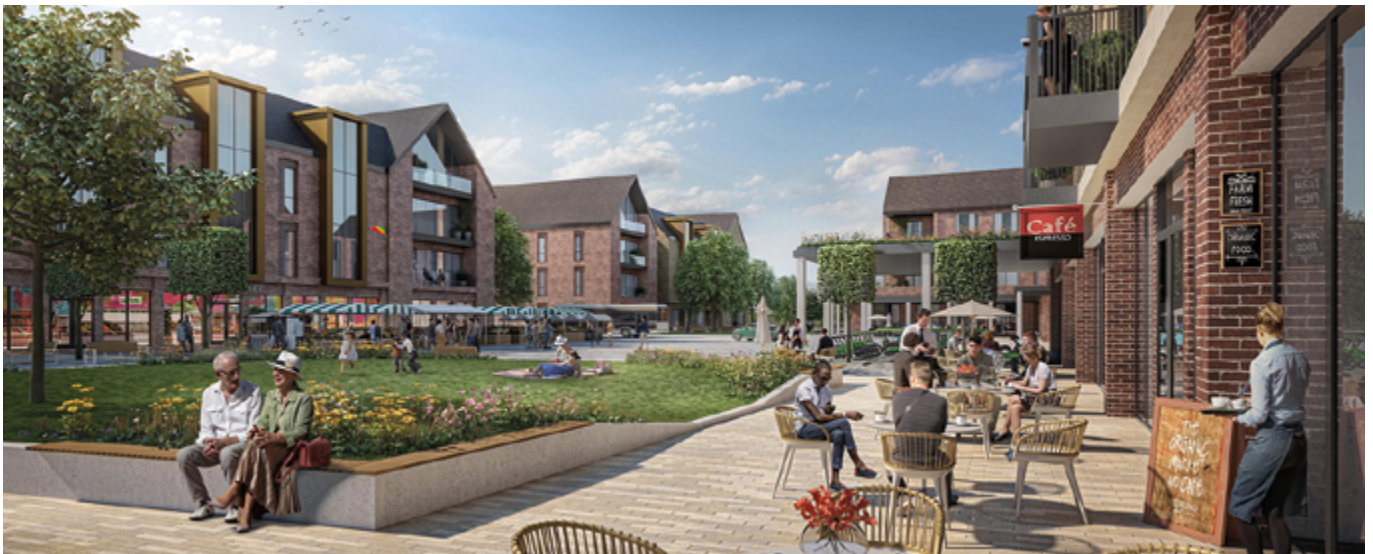
Illustrative image of what the village centre could look like based on the most recent proposals as presented at our May 2021 consultation events

Our third Design Review Panel was held on 28th May, following the third chapter of engagement. The Design Review Panel is an independent group of professionals with architectural and design expertise who review our proposals and make recommendations to help shape the plans. The reports from the first and second Design Review Panels are available on our website, and the third will be available shortly.