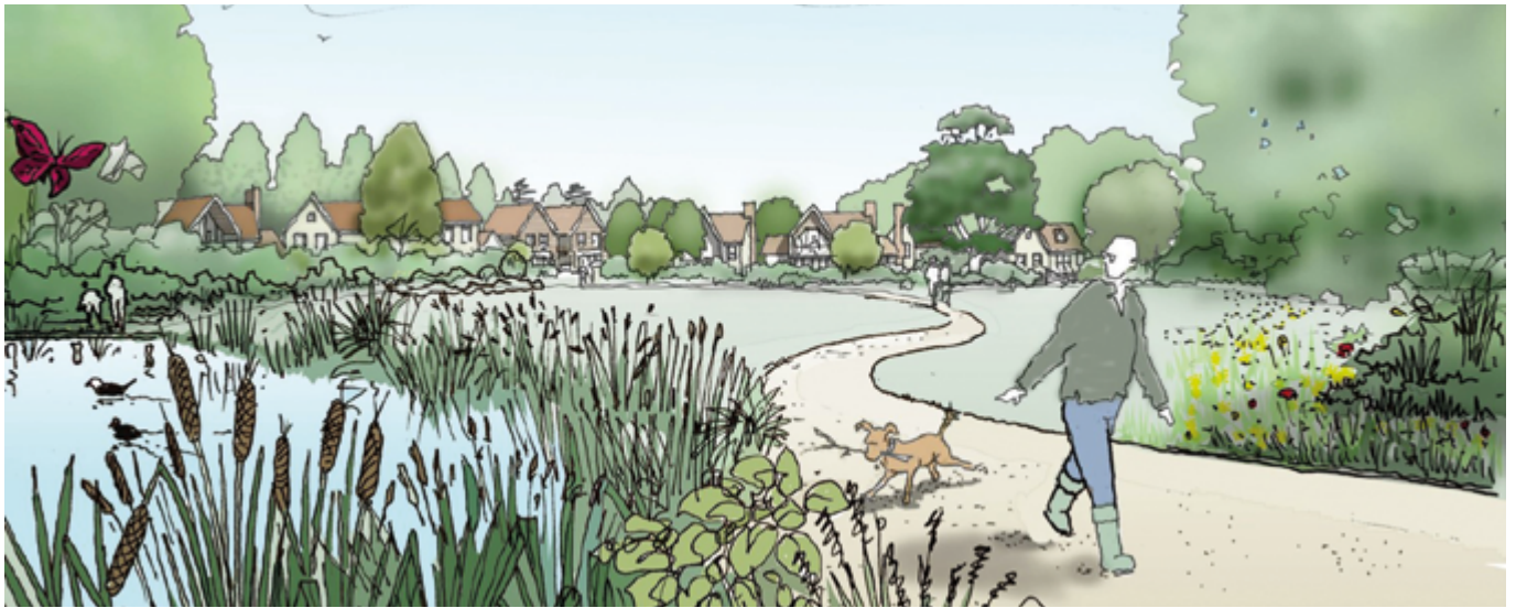
Illustrative image of how the SANG could look at the former Wisley Airfield