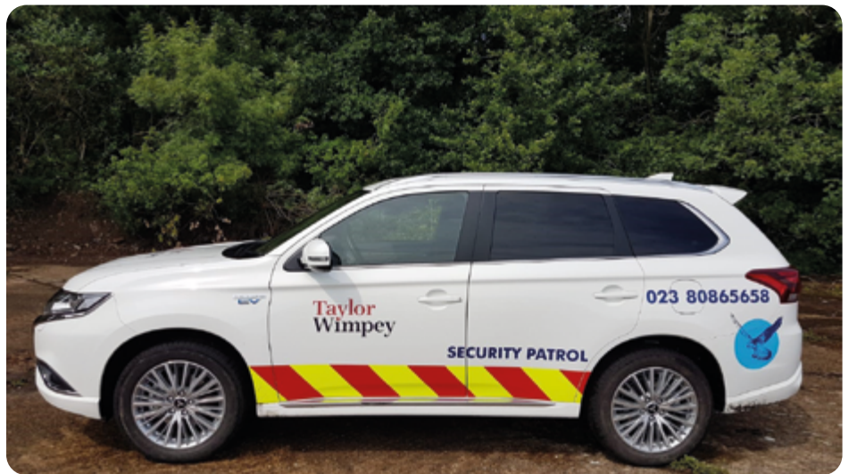
Taylor Wimpey security

Please do not approach anyone on the site, instead contact our security team to log an incident and they will do their best to make sure any issues are dealt with appropriately.