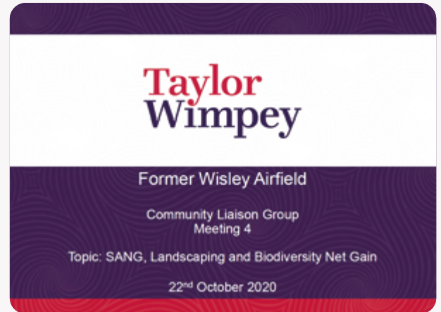
The minutes and presentation from our fourth Community Liaison Group are now available on our website.

Minutes of these sessions are published on our website at www.wisleyairfield.com/library , along with the presentations, so please do take a moment to read through to read the discussions had on each topic.. These sessions are a really valuable opportunity for us to get the thoughts of the community representatives, so please do speak to your representative or contact the team directly using the details below to make sure your feedback is heard.