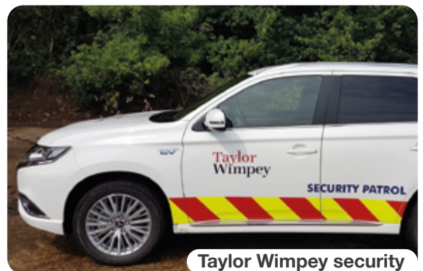
Taylor Wimpey security

Please do not approach anyone on the site, instead contact our security team to log an incident and they will do their best to make sure any issues are dealt with appropriately.