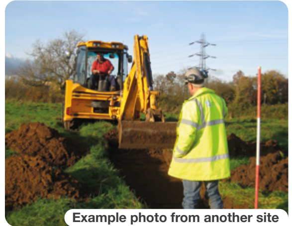
Example photo from another site

Please do not hesitate to contact us should you wish for further information on the archaeology works.